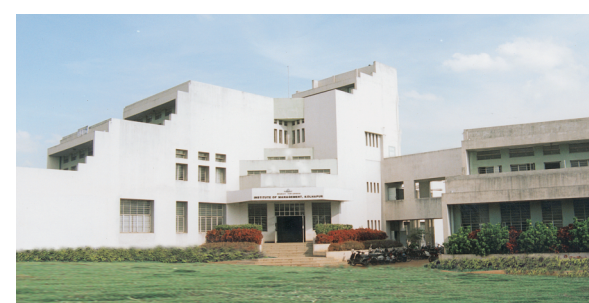
BVDU Institute of Management, Kadamwadi, Kolhapur – 416003 Tel. No. 0231 – 2660666