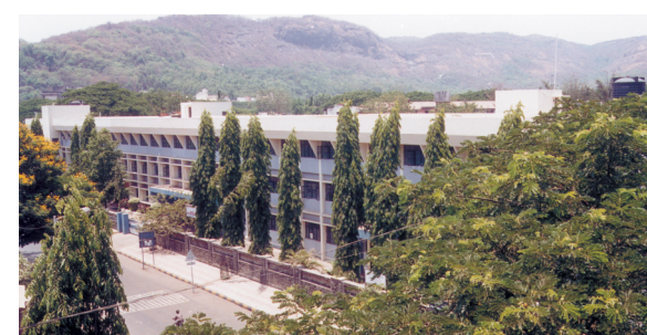
BV Institute of Management Studies & Research, Sector-8, C.B.D. Belapur, Navi Mumbai – 400614 Tel. No. 022 – 27572433, 27562582