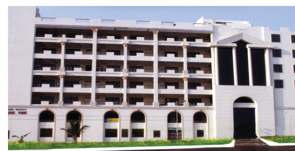
BVDU New Law College, Paud Road, Erandwane, Pune – 411038 Tel. No. 09156911396, 020-25444616