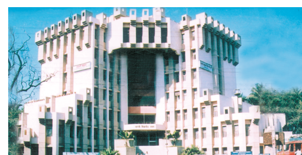
BVDU Institute of Management & Rural Development Administration Rajwada Chowk, Sangli – 416416 Tel. No. 0233 – 2325776, 2625776