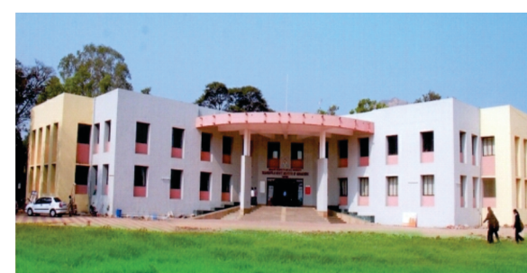
BVDU Yashwantrao Mohite Institute of Management, Sr. No. 114/2A, Venkateshnagar, Koyana Vasahat, Pune-Bangalore Road, Malkapur, Karad – 415539 Tel. No. 02164 – 242242, 241169