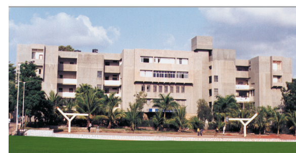
BVDU Institute of Management & Entrepreneurship Development, Paud Road, Erandwane, Pune – 411038 Tel. No. 020 – 25431060, 8485821415