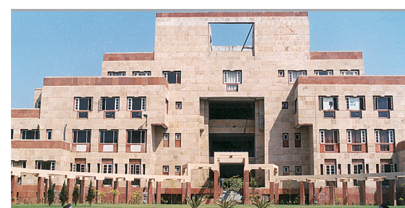
BVDU Institute of Management & Research Opp. Ordnance Depot, A-4, Rohtak Road, NH-10, Paschim Vihar Ext., New Delhi -110063 Tel. No. 011-25278446, 25285808, 25284396 Ext. 204, 272, 409, 290, 144, 234 Mob : 9250547204, 9717253343, 8376092220, 8363969770