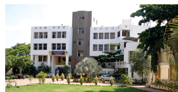
BVDU Abhijit Kadam Institute of Management & Social Sciences, Bijapur Road, Solapur – 413004 Tel. No. 0217 – 2302016