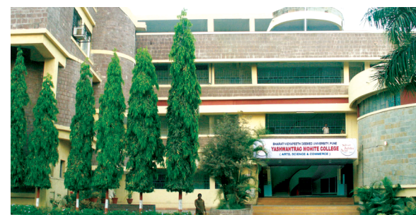
BVDU Yashwantrao Mohite College of Arts, Science & Commerce, Paud Rd., Erandwane, Pune – 411038 Tel. No. 020 – 25433383