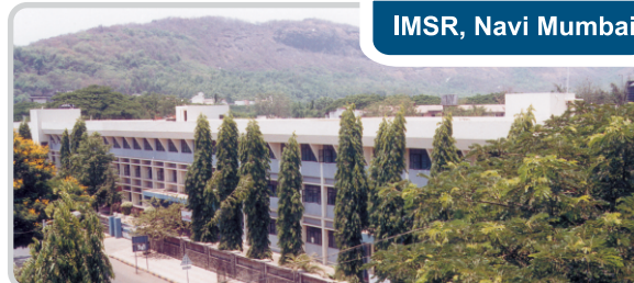
IMSR, Navi Mumbai

BV Institute of Management Studies & Research, Sector-8, C.B.D. Belapur, Navi Mumbai – 400614 Tel. No. 022 – 27572433 / 27562582