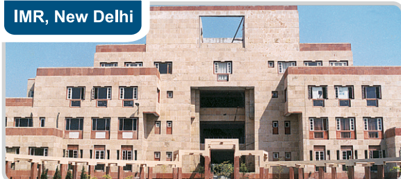
IMR, New Delhi

BVDU Institute of Management & Research, Opp. Ordnance Depot, A-4, Rohtak Road, NH-10, Paschim Vihar Ext., New Delhi -110063 Tel. No. 8383969770 / 8368987174 / 9717253343 / 9250547204