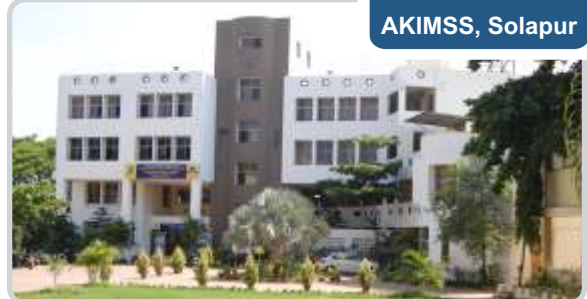
BVDU Abhijit Kadam Institute of Management & Social Sciences, Bijapur Road, Solapur – 413004 Tel. No. 0217-2302016