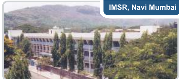
BV Institute of Management Studies & Research, Sector-8, C.B.D. Belapur, Navi Mumbai – 400614 Tel. No. 022 – 27572433 / 27562582