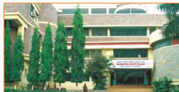
BVDU Yashwantrao Mohite College of Arts, Science & Commerce, Paud Rd., Erandwane, Pune – 411038 Tel. No. 020 – 25433383