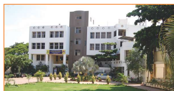
BVDU Abhijit Kadam Institute of Management & Social Sciences, Bijapur Road, Solapur – 413004 Tel. No. 0217 – 2302016