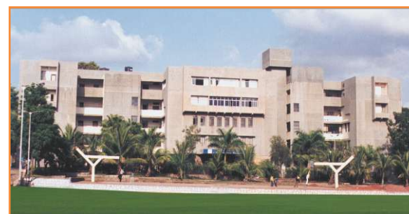
BVDU Institute of Management & Entrepreneurship Development, Paud Road, Erandwane, Pune – 411038 Tel. No. 020 – 25431060, 8485821415