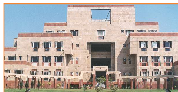
BVDU Institute of Management & Research Opp. Ordnance Depot, A-4, Rohtak Road, NH-10, Paschim Vihar Ext., New Delhi -110063 Tel. No. 011-25278446, 25285808, 25284396 Ext. 204, 272, 409, 290, 144, 234 Mob : 9250547204, 9717253343, 8376092220, 8383969770