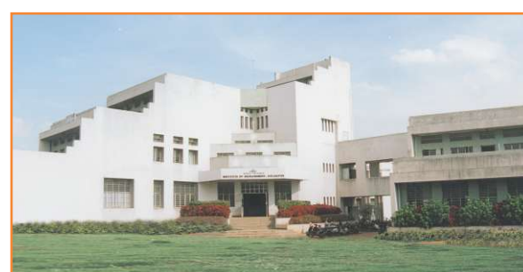
BVDU Institute of Management, Kadamwadi, Kolhapur – 416003 Tel. No. 0231 – 2660666