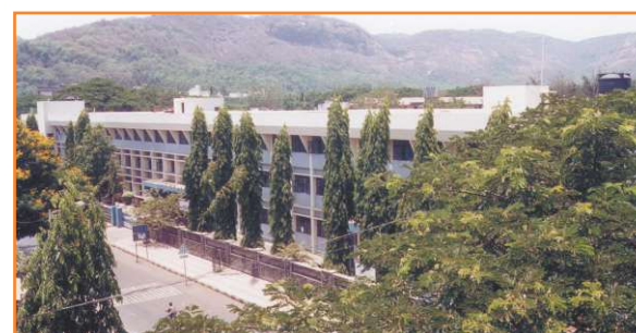
BV Institute of Management Studies & Research, Sector-8, C.B.D. Belapur, Navi Mumbai – 400614 Tel. No. 022 – 27572433, 27562582