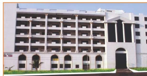
BVDU New Law College, Paud Road, Erandwane, Pune – 411038 Tel. No. 09156911396, 020-25444616