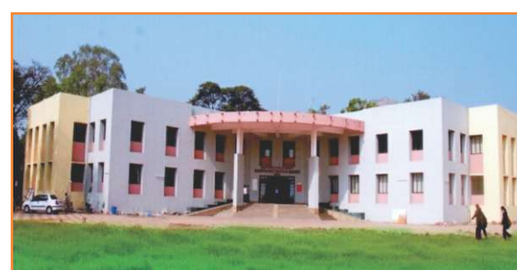
BVDU Yashwantrao Mohite Institute of Management, Sr. No. 114/2A, Venkateshnagar, Koyana Vasahat, Pune-Bangalore Road, Malkapur, Karad – 415539 Tel. No. 02164 – 242242, 241169