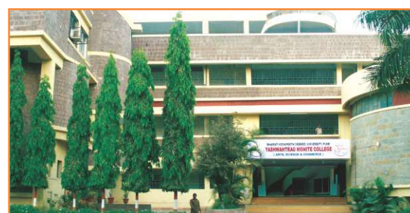
BVDU Yashwantrao Mohite College of Arts, Science & Commerce, Paud Rd., Erandwane, Pune – 411038 Tel. No. 020 – 25433383