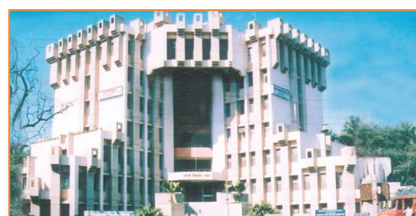
BVDU Institute of Management & Rural Development Administration Rajwada Chowk, Sangli – 416416 Tel. No. 0233 – 2325776, 2625776