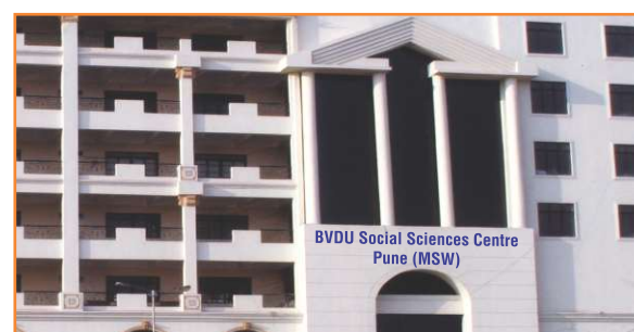
BVDU Social Science Centre Paud Road, Erandwane, Pune - 411038 Tel. No. 020-25448520